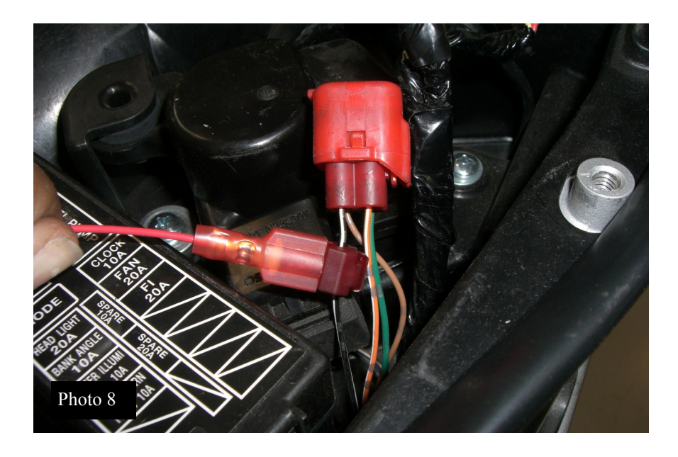
11. Insert the Switched Power (red tag) T-TAP into the Scotchlok.

The Bazzaz Z-Fi controller is capable of storing two maps. These maps can be selected through the use of a map select switch which can be mounted on the handlebar for easy access and can be purchased separately. Or these maps can be selected by connecting or disconnecting the map select jumper supplied with kit. When the map select jumper is connected the control unit is operating using Map 1 which is the map for the 07-08 models. When the map select jumper is disconnected the control unit is operating using Map 2 which is the map for the 09-11 models.